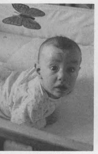
Retirement Credit! Who, me? Instruction Book? Who reads?